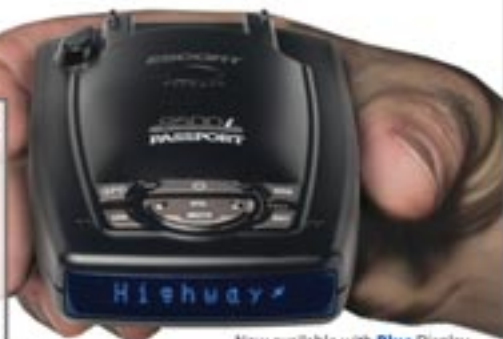
Now available with Blue Display

Limited Time Offer Trade-in your old detector and save!