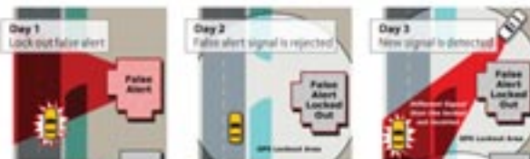
GPS-powered TrueLock™ technology permanently locks out false alerts by exact location and frequency.

PASSPORT 9500i • Red $449.95 + S&H (OH res. add tax) PASSPORT 9500i • Blue $499.95 + S&H (OH res. add tax)